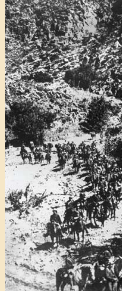
Company G, 8th Cavalry unit stationed at Fort Selden in Box Canyon, New Mexico, 1871–3.